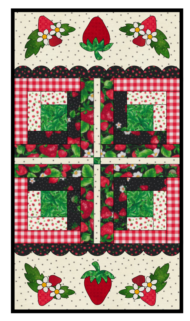
Finishes to: 13" \times 23"