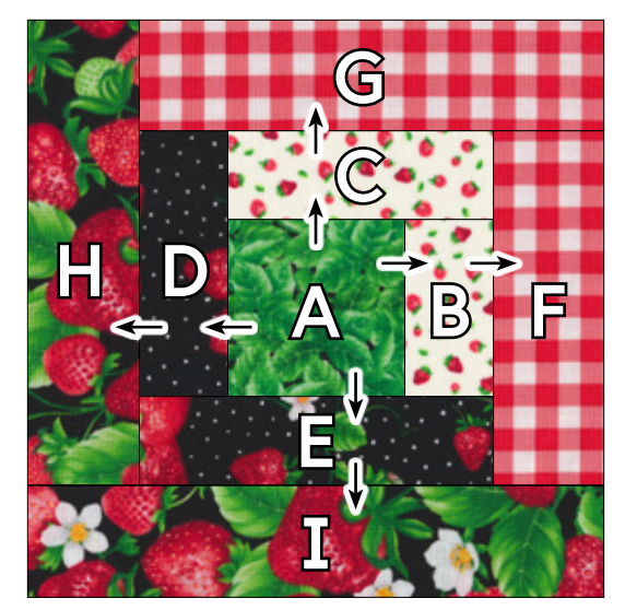
Log Cabin Block - Make (4)