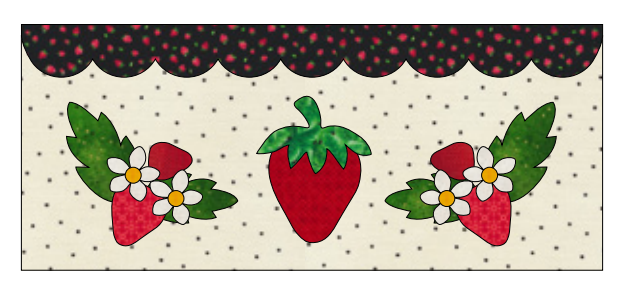
Appliqué - Make (2)

STEP 4: Position and fuse flower centers and black scallops (15-19). Appliqué flower centers with yellow thread, and appliqué scallops with black thread.